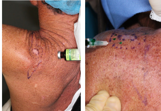
Left shoulder melanoma injected with indocyanine green.

Combining existing gamma probe technology, methylene blue visualization, with the ICG guided near infrared lymphangiography shortens the operative time, limits the surgical dissection, and increases the precision of lymph node detection.