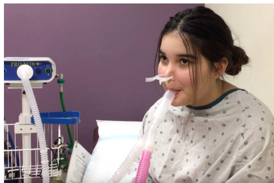
Graphic of a young patient using Pro-Nox™. This is not the patient referenced in this article.

Pediatric patients present a challenge for dermatologists and plastic surgeons when office surgical treatment is required. Unlike adults, children often require the operating room with anesthesia sedation when a simple excision is required. Office-administered nitrous oxide is changing that. Pro-Nox™ nitrous oxide system is bringing analgesia and light sedation into the office setting. The machine is simply a control valve that mixes oxygen with nitrous oxide as a 50:50 mixture. The flow is dependent upon the patient's inhalation effort, while providing no passive flow. This eliminates the need for gas