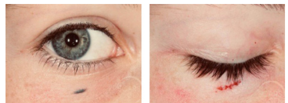
Blue nevus in an 8 year old excised with use of Pro-Nox™.

The treatment involves having the patient take 3 deep breaths while sucking on the Pro-Nox™ tubing. The effect is felt after 3 breaths. In many patients, 5 breaths are required for the desired result. Holding the breath at the peak of inhalation maximizes nitrous oxide absorption. Repeat inhalations may be required after 3 minutes as the effect wears off quickly. Our adult patients can drive 30 minutes after the last inhalation. In some patients, more than 5 breaths may cause brief nausea. Our patients have found this to be an important aid for anxiety and discomfort. Pro-Nox™ has expanded the possibilities of office procedures under local anesthesia.